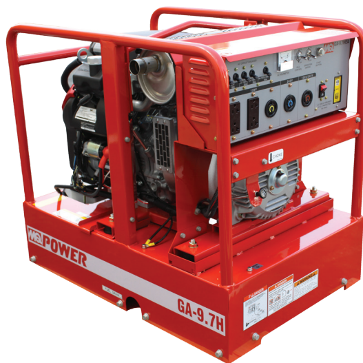
GA97HEA 9700 watts max. Honda engine, electric start Battery sold separately