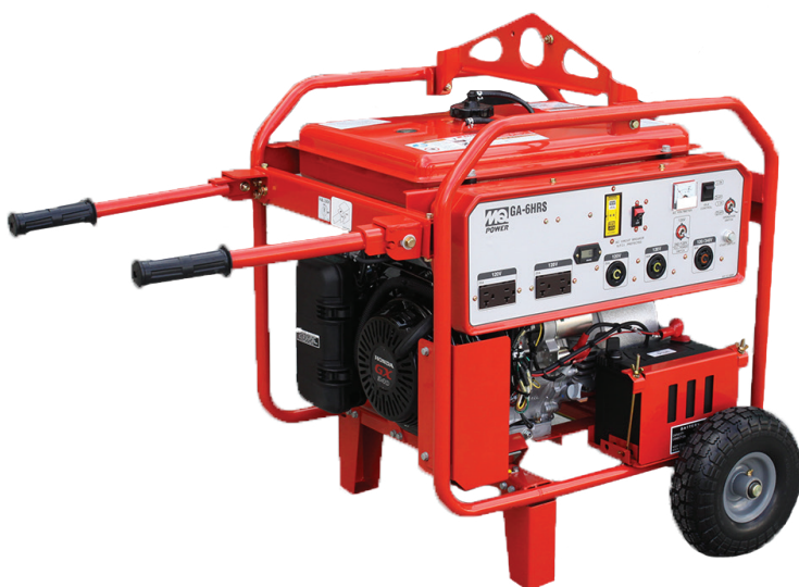
GA6HRS 6000 watts max. Honda engine, recoil/electric start Battery sold separately