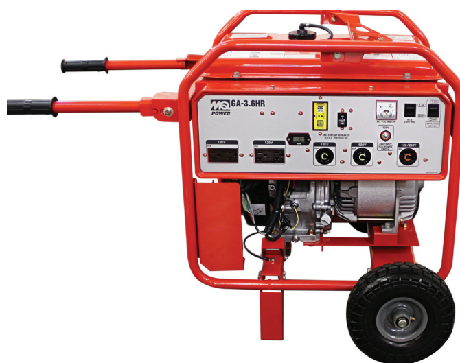
GA36HR 3600 watts max. Honda engine, recoil start