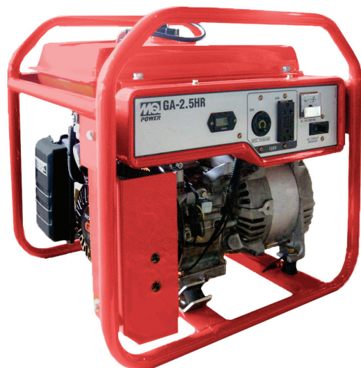
GA25HR 2500 watts max. Honda engine, recoil start

There's a size and model for every application.