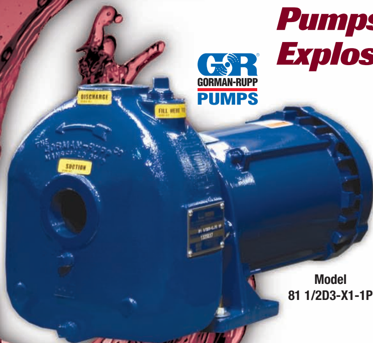
Model 81 1/2D3-X1-1P