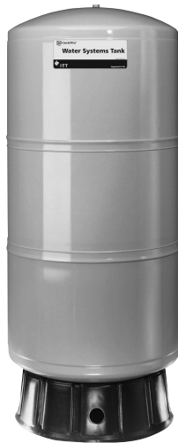
Stand Model (Vertical)