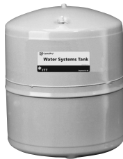
In-Line Pipe Mounted Model